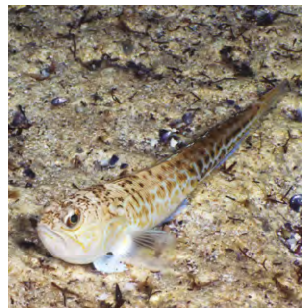
ABOVE Weaver Fish

Jellyfish that sting are not usually found in Seaford Bay.